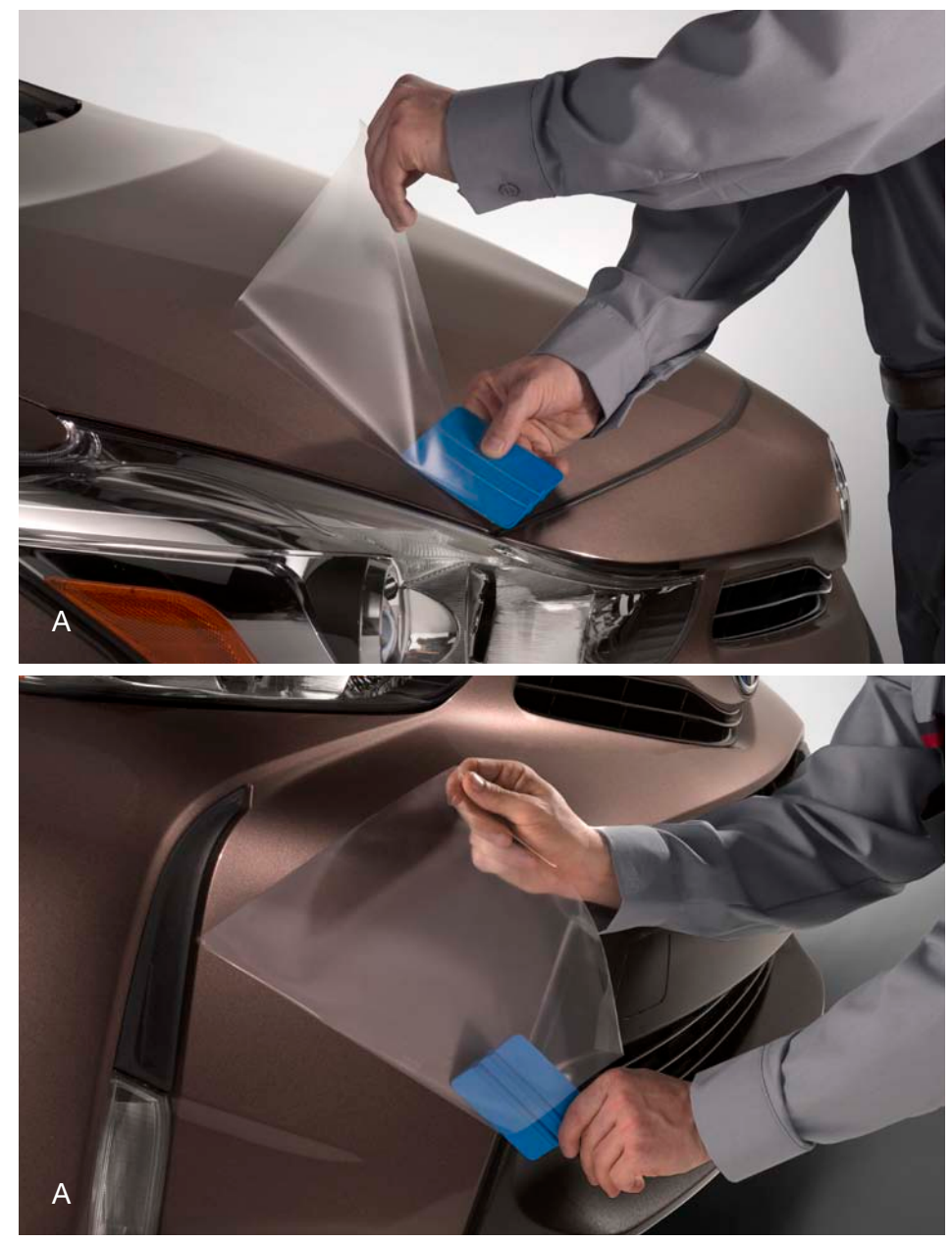
See footnote 1 in disclosure section on back cover.

Paint protection film is available for select areas of the hood/fenders, and front bumper (each set sold separately)