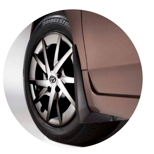
EXTERIOR Protect and enhance your Prius v exterior in style.